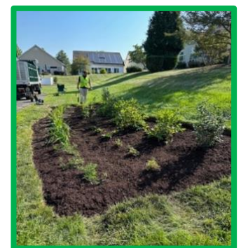
Planting Buffer Garden