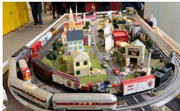
Festival of Trains at Kent Narrows Outlet Center, Saturday, December 3

So much to enjoy! Scroll through the listings for more adventures!