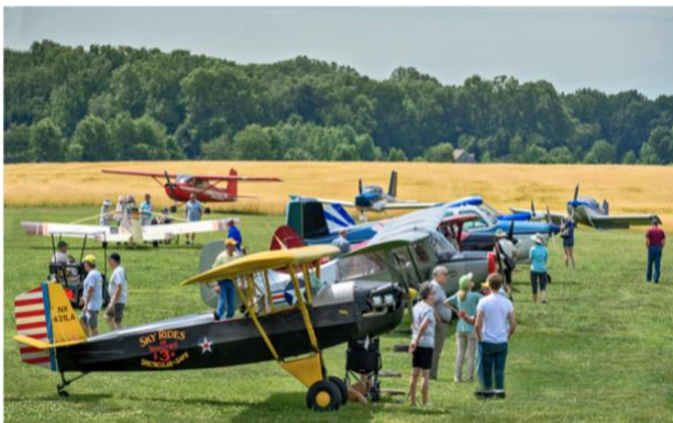
Massey Open Hangar Party & Fly-in Saturday, December 3