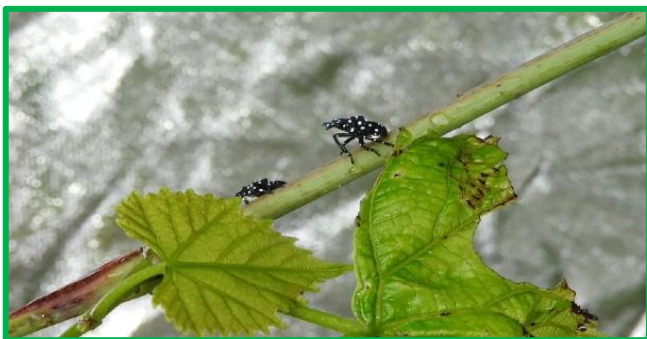
Spotted lanternfly nymphs (first instar)