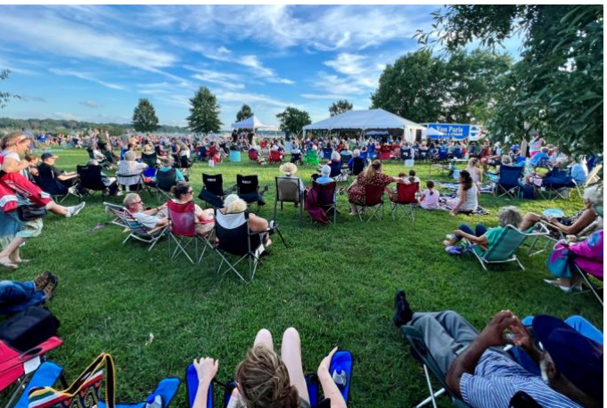
Godfrey's Farm open through Labor Day