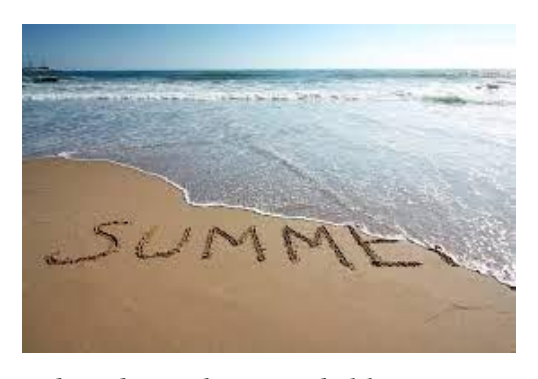
Friends, sun, sand, and sea, that sounds like a summer to me. Unknown

We are fast approaching the last days of summer. There is still time to come out and enjoy many scheduled activities at Symphony Village. We would love to see you there.