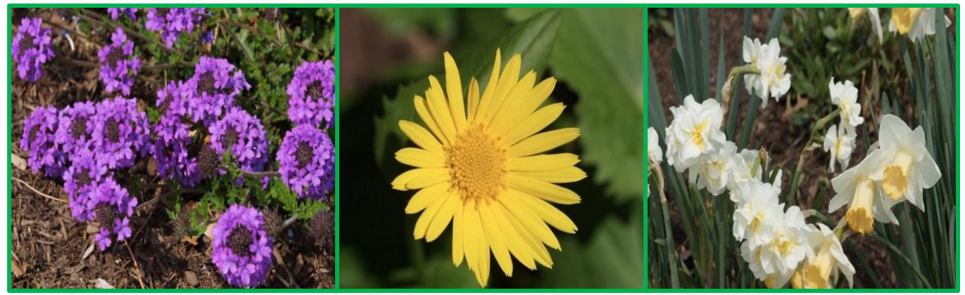
Enjoy the different seasons.