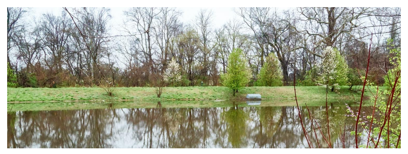
Stormwater Pond 1 (after heavy rain)