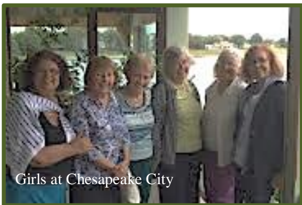
Girls at Chesapeake City

The reorganized Social Singles had a banner year! It all started in February when we rented a house on Anna Maria Island, Gulf of Mexico, Florida. Even some of our neighbors on Harmony who are not members of the Singles came and filled up the bedrooms. All had a great time.