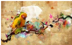
Exhibit: "No Holds Barred – Avant Garde"

The Kent Island Federation of Art (KIFA) (405 Main Street) in Stevensville will host an exhibit "No Holds Barred – Avant Garde" August 6 – 30. Non-traditional artists will show their work. The exhibit is free and open to the public. Gallery hours are Tuesday, 10 a.m. – 1 p.m.; Wednesday – Friday, 10 a.m. – 4 p.m.; and Saturday, 1 – 4 p.m. ( QAC Tourism )