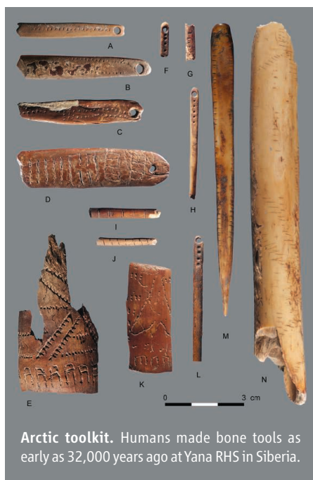
Arctic toolkit. Humans made bone tools as early as 32,000 years ago at Yana RH5 in Siberia.

CREDITS (TOP TO BOTTOM): WAYNE SIMPSON/ALL CANADA PHOTOS/CORBIS; V. V. RYULKO ET AL., ANTIQUITY 86, 333 (SEPTEMBER 2012) © ANTIQUITY PUBLICATIONS LTD.