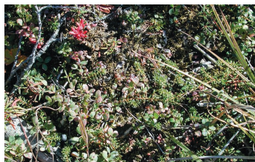
Light my fire. Woody plants in Beringia’s shrub tundra may have supplied firewood and tools for humans.