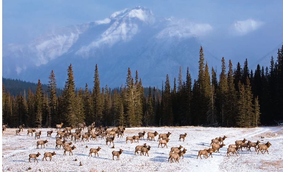
Early adapters. Denizens of temperate and boreal forests today, elk survived ice age cold in Beringia.

Willerslev’s samples came from areas of Beringia still on dry land. But pollen from what is now the sea floor suggests that different vegetation may have cloaked the lowlands, which would have been slightly warmer and moister than other areas. Pollen from a sediment core drilled near the coast of the central Beringian lowland shows that some trees and shrubs—including spruce, birch, and alder—survived the LGM, as graduate student Rachel Westbrook of the University of Alaska, Fairbanks, and col-