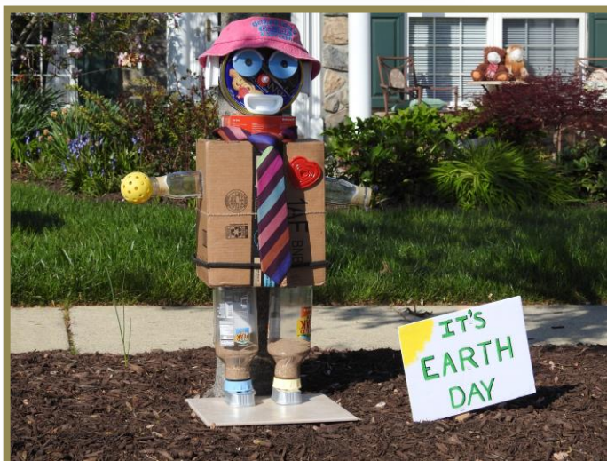
Earth Day Photo Submitted by George Drake